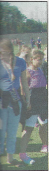
Students pass a hula 2015.